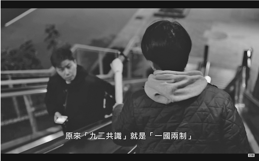
Screensbot from Tsai Ing-wen campaign advertisement.