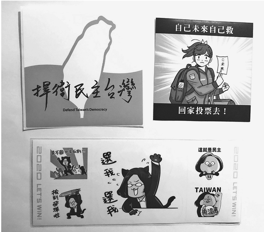
Stickers from Tsai Ing-wen's DPP Headquarters in Taipei, Taiwan.