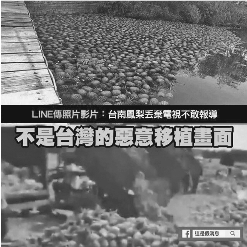
Image that accompanied a message blaming the DPP for dropping pineapple sales. The photos were later proven to be taken in the PRC, not Taiwan.