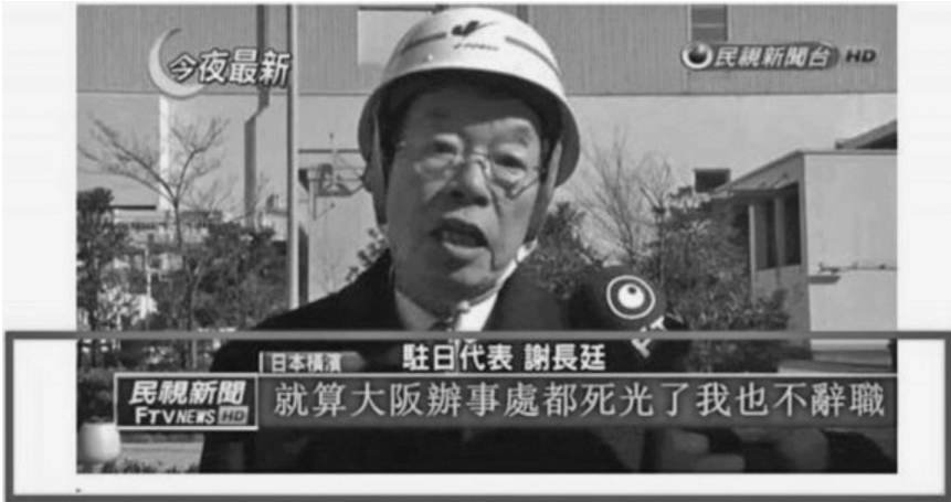
Image of ROC Ambassador to Japan Frank Hsieh, September 2018, with doctored chyron reading, “Even if all staff members in the Osaka office die, I will not resign.”