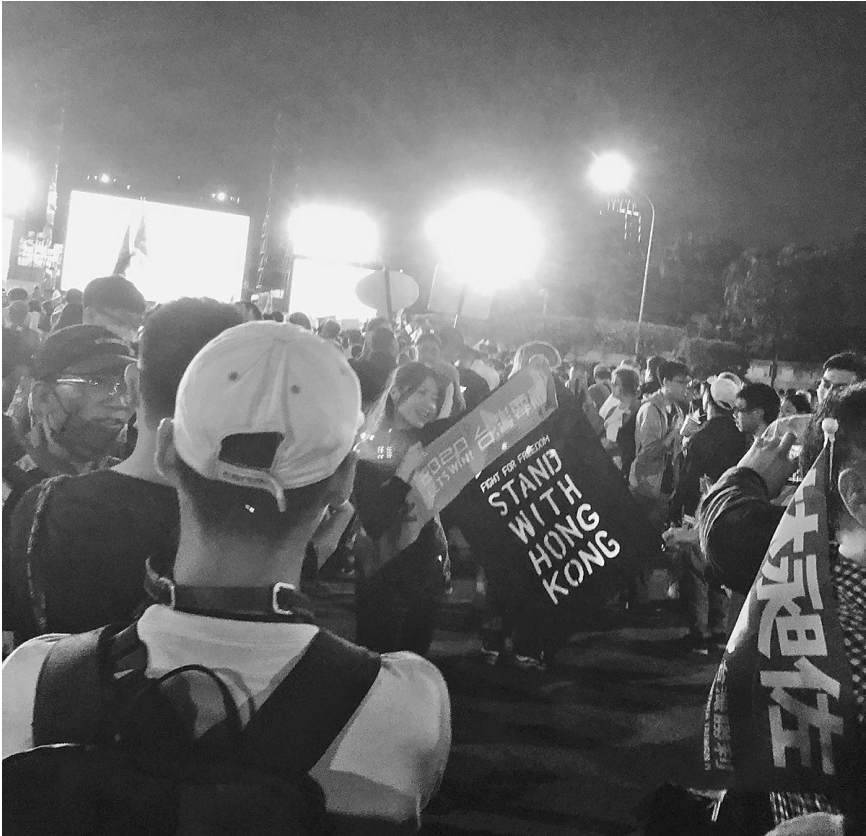
Supporters of the Hong Kong protestors display flags at Tsai Ing-wen Pre-Election Rally in Taipei, Taiwan (January 10, 2020).