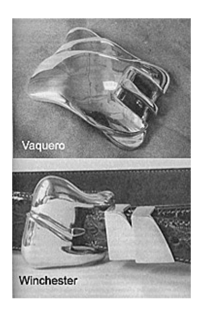
FIGURE 4: Belt buckles at issue in Kieselstein-Cord v. Accessories by Pearl , 632 F.2d 989 (2d Cir. 1980).

The Kieselstein-Cord majority began its opinion by asserting that the dispute lay "on a razor's edge of copyright law." This description may have been a self-fulfilling prophecy, for the panel proceeded to engage in an in-depth analysis of the notion of copyright protection for "conceptually separable" components of industrial design and applied art in a dispute that involved only physically separable belt buckles—objects rather analogous to the sculptural lamp base deemed copyrightable by the Supreme Court, some thirty-six years earlier, in Mazer v. Stein. 302 The panel, apparently not tempted by the low-hanging fruit of "physical separability," wrote: "We see in appellant's belt buckles conceptually separable sculptural elements, as apparently have the buckles' wearers who have used them as ornamentation for parts of the body other than the waist. The primary ornamental aspect of the Vaquero and Winchester buckles is conceptually separable from their subsidiary utilitarian function."303 The key to copyrightability, in other words, lay in the buckle's independent appeal as a work of art. The buckle was thus similar to one of the few categories of fashion-related goods wellestablished as copyright-eligible: "Pieces of applied art, these buckles may