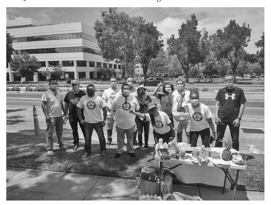
Image 2: This photo was taken at an August 2020 PPE Action in the South Bay. Rideshare Drivers United organizers were distributing food, personal protective equipment, and talking to other drivers about Prop 22.